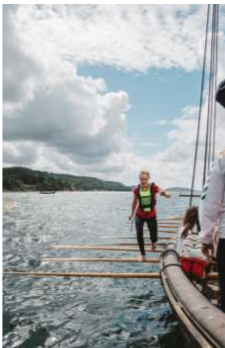
Side Events, Vestfold 2017

The cost for this is not included in the Participants card.