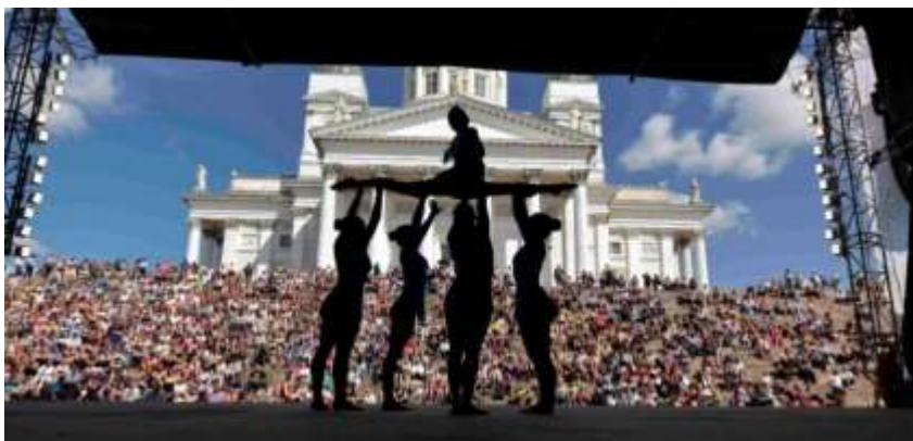
City performance, Helsinki 2015

The cost for this is not included in the Participants card.