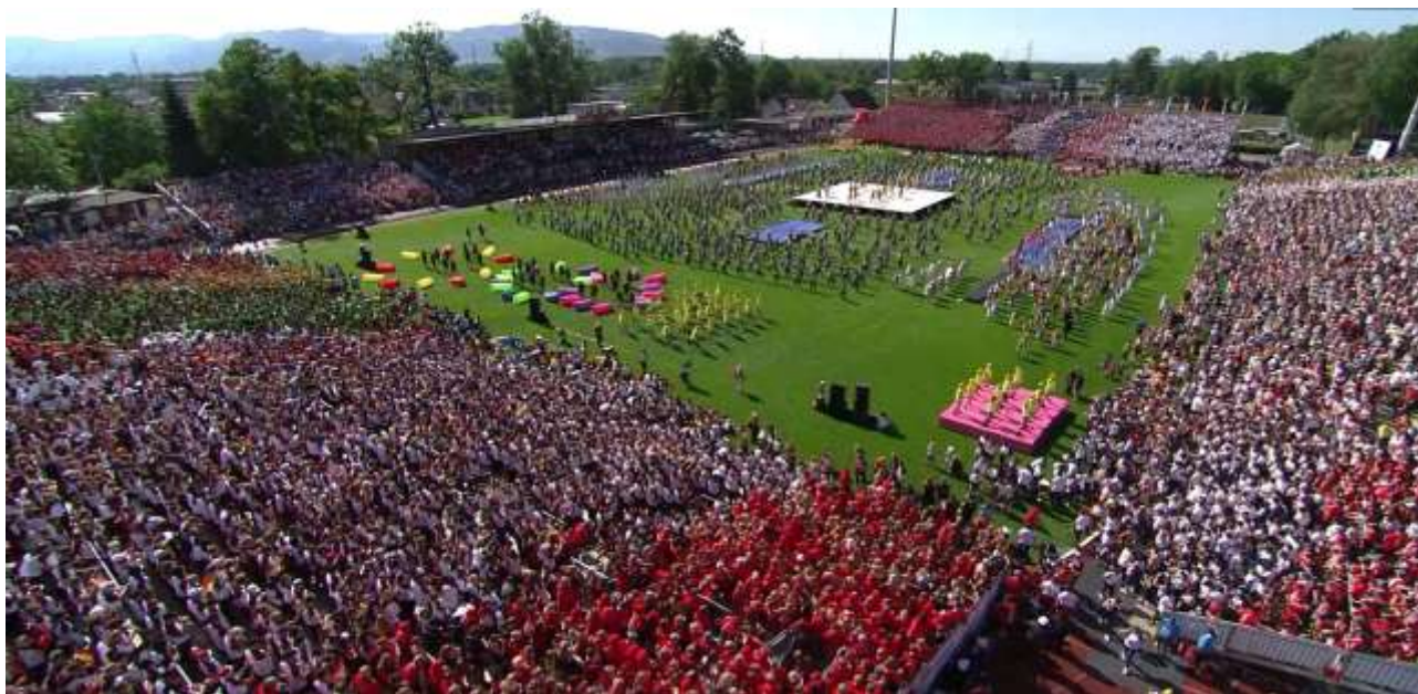
Opening Ceremony, Dornbirn 2019

The ceremony takes place on the first day of the World Gymnaestrada.