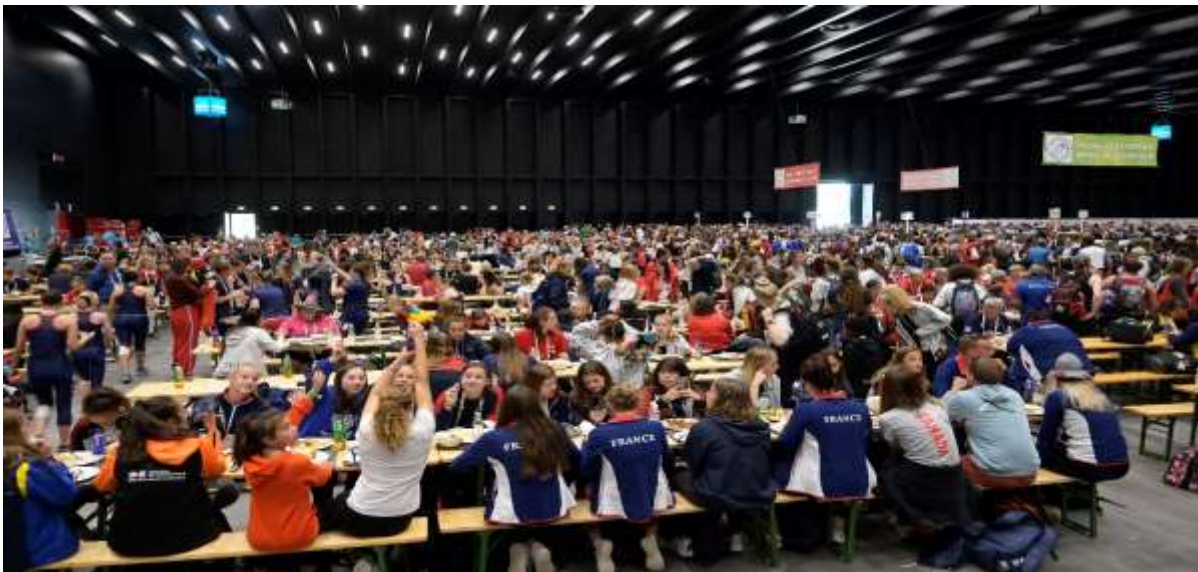
Catering place, Dornbirn 2019

The area for catering should be an indoor facility, which has the capacity to cater for a large number of participants at the same time. Consideration must be given to efficient serving and the flow of participants entering and exiting the area whilst also providing a relaxed and friendly atmosphere where participants can enjoy their meal.