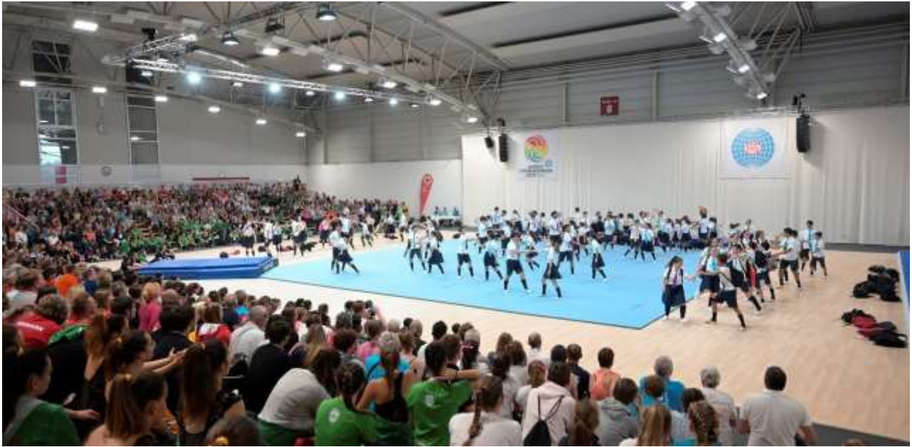
Group performance, Dornbirn 2019

All performance areas must have a backdrop and be equipped with a sufficient floor suitable for gymnastics.