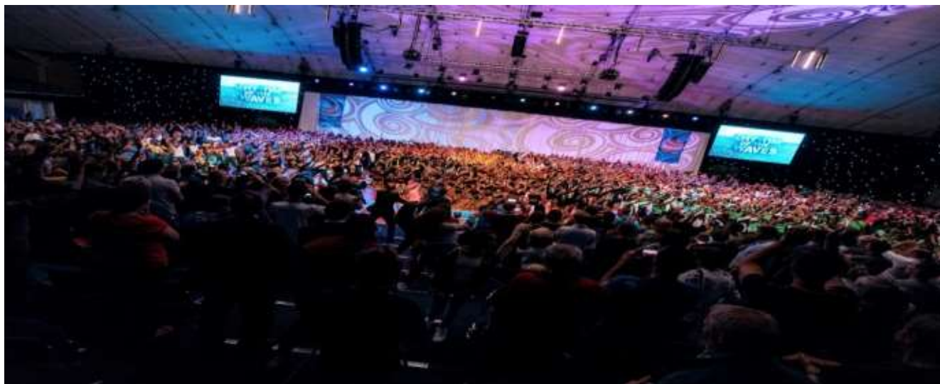
Closing Ceremony, Vestfold 2017

The ceremony marks the ending of a festive, cheerful week. The Ceremony is attended by all participants of all participating FIG affiliated Federations.