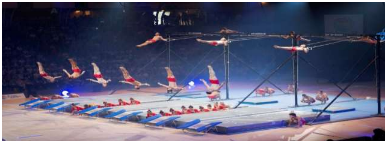
National Performance, Dornbirn 2019

After the FIG and LOC's confirmation of participation, and before the Provisional Registration, the agreement has to be signed by oth parties.