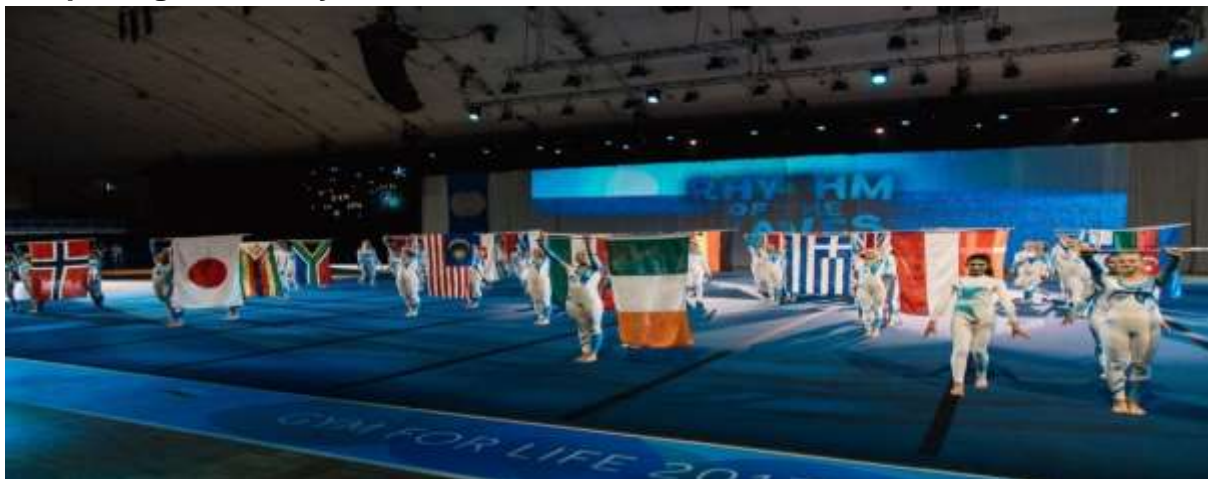
Opening Ceremony, Vestfold 2017

The ceremony shall take place on the first day of the World Gym for Life Challenge