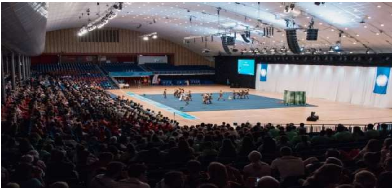
Contest, Vestfold 2017