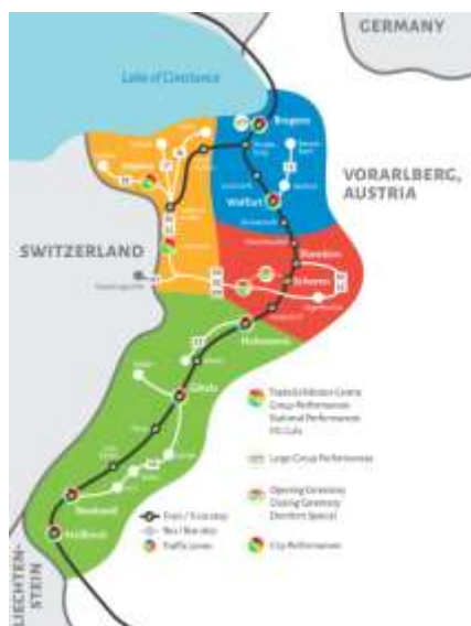
Map of the transportation zones, Dornbirn 2019