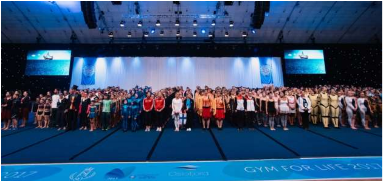
Contest, Vestfold 2017

Each gymnast receives either a Gold, Silver or Bronze medal and each group receives a certificate.