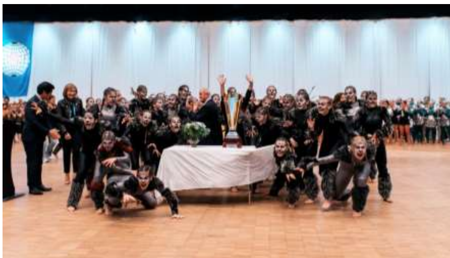
Gala, Vestfold 2017

When announcing the WORLD GROUP CHAMPION, this group's national flag will be presented while their national anthem is played.