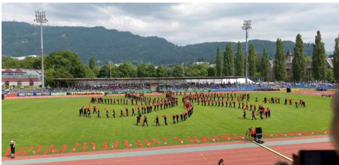
Large Group performance, Dornbirn 2019

The same venue as the Opening Ceremony can be used depending on local facilities.