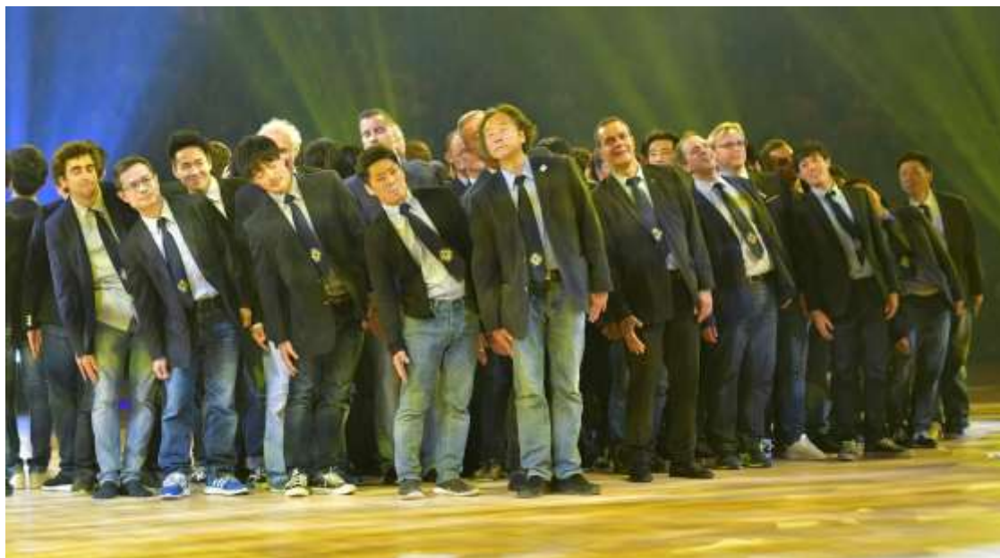
FIG Gala, Dornbirn 2019