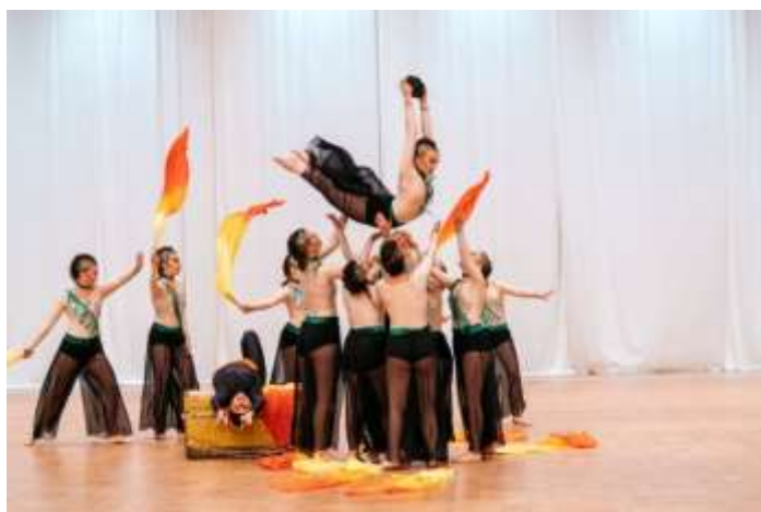
Contest, Vestfold 2017

The Gala choreographer, appointed by the LOC, will determine the start order of the participating groups. The Choreographer is also responsible for the Gala rehearsal. Participation at the rehearsal is compulsory for the 16 groups.