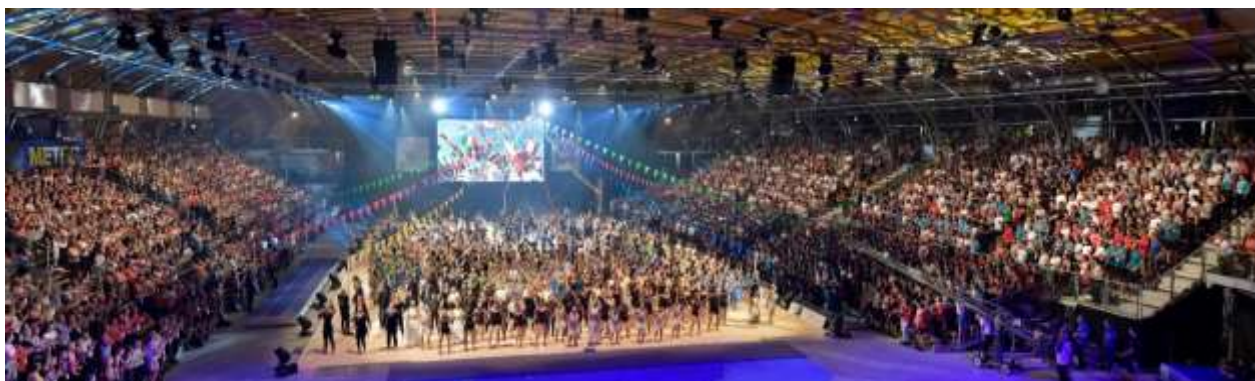
FIG Gala, Dornbirn 2019